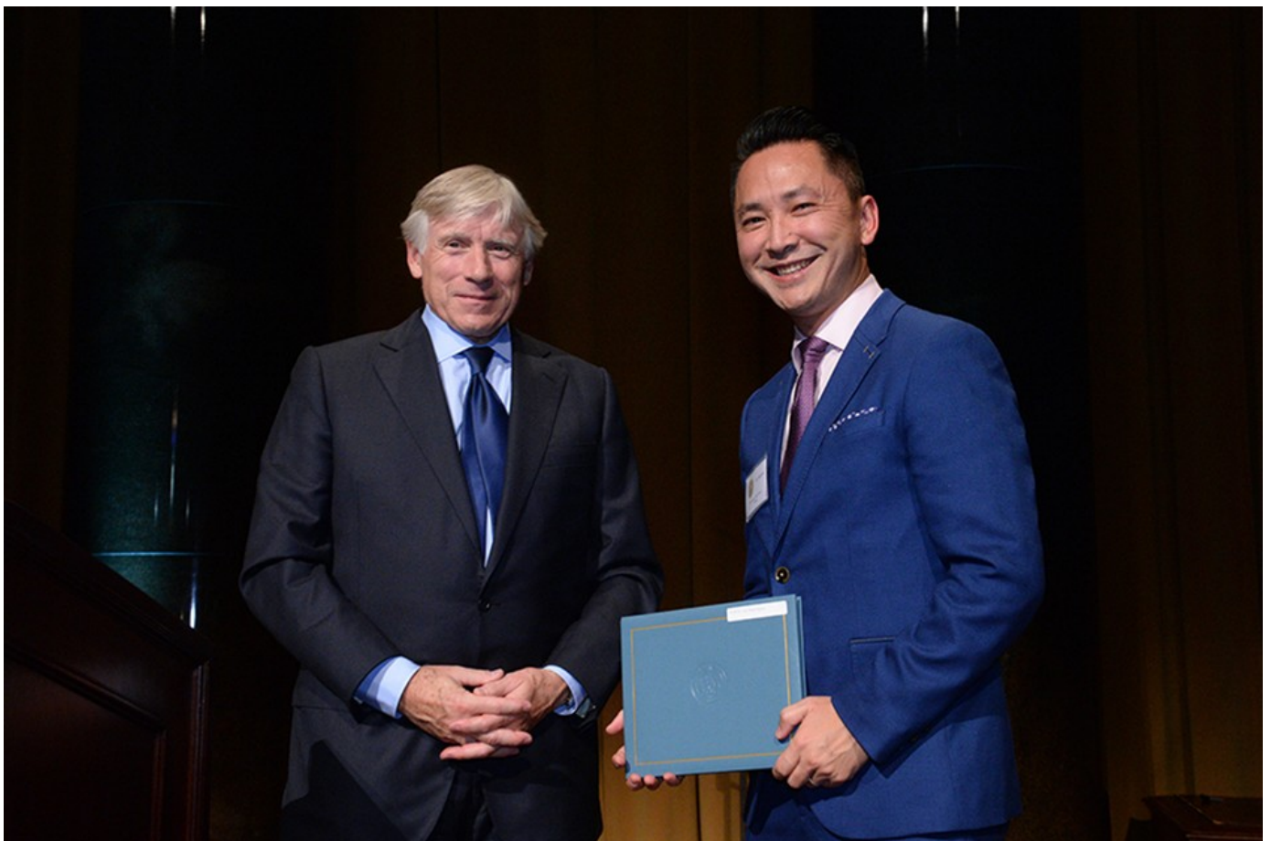
Columbia University President Lee C. Bollinger (left) presents the 2016 Fiction Prize to Viet Thanh Nguyen.

A layered immigrant tale told in the wry, confessional voice of a "man of two minds" -- and two countries, Vietnam and the United States.